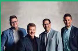
Down East Boys