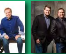
The Old Paths