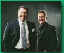
Wilburn & Wilburn